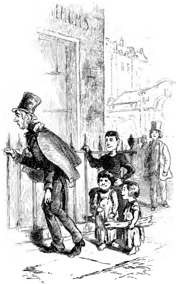
THE CAPTAIN WON'T GO HOME TILL MORNING